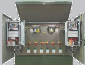
Pad Mount Switchgear