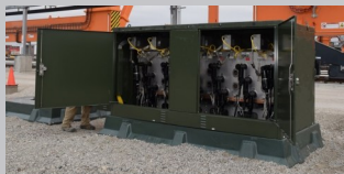
Solid Dielectric Switchgear

Custom Switchgear, Switchboards and Panels