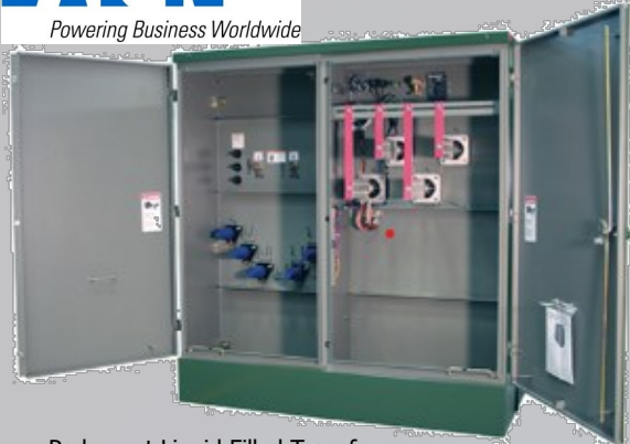
Padmount Liquid Filled Transformers